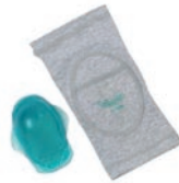
Heel and elbow protectors

This product is user friendly, lightweight, discreet and provides protection for all areas at high risk from pressure sores and nerve damage.